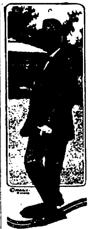
Senator A. B. Cummins.